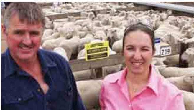
Identifying SuperBorder$ progeny gives a marketing advantage